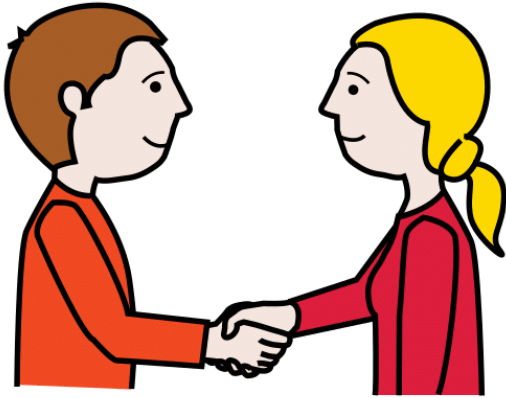
DARE LA MANO