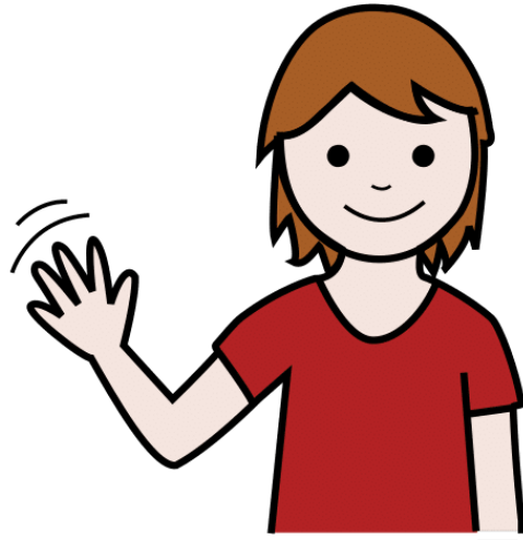
CON LA MANO O CON IL SORRISO